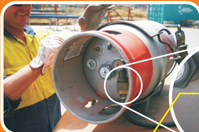
Hose connection must be tightened all the way to the top