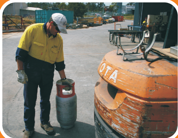
Always carry cylinder from handles