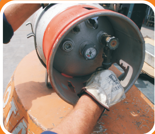
Wear gloves when connecting hose to avoid cold burns