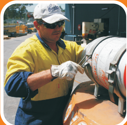
Cylinder must be secured onto forklift