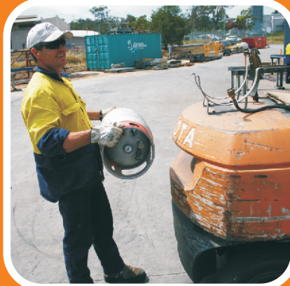
Keep your back straight when lifting