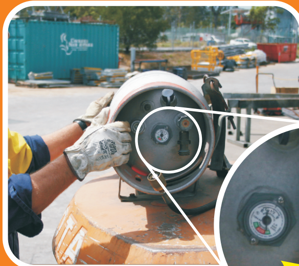
Make sure connection is vertical to ensure all gas is used