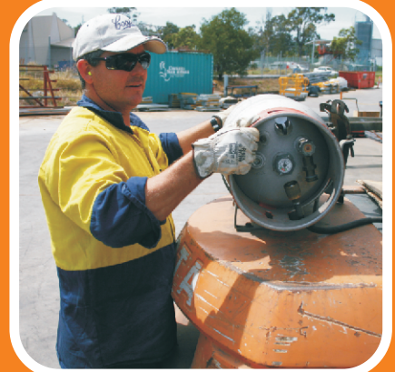
Position correctly in cylinder carrier