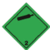
2.2 : Non-flammable, non-toxic gases